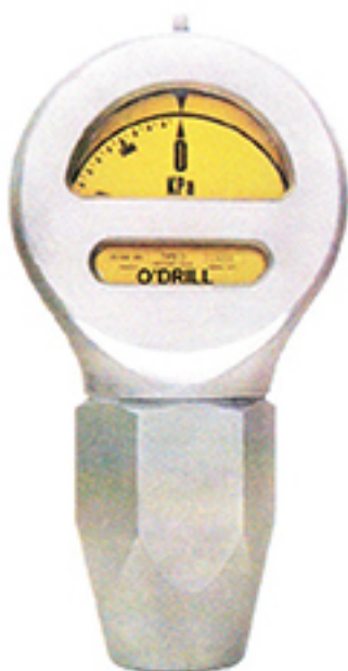
TYPE - D