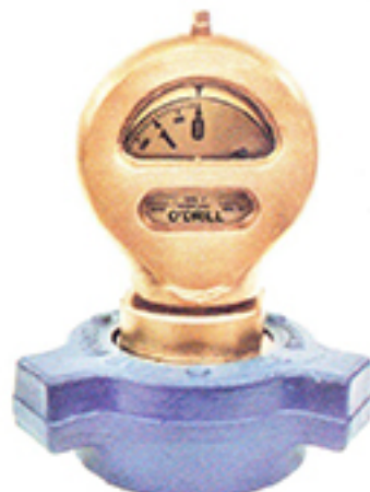
TYPE F Nut

◀ 100% INTERCHANGEABLE WITH CAMERON® AND OTECO® GAUGES ▶