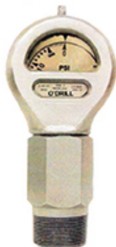
TYPE - F