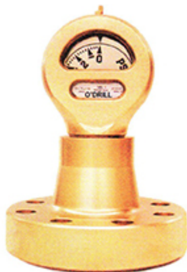
TYPE F Flanged